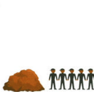
5 man with their wheelbarrow

Hardwood, softwood, and coloured wood mulch have never been applied more effortless, and the smooth, professional look of the blown material is unrivalled. With the remote control, the volume of output can be adjusted quickly to a minimum flow for spreading around delicate flowers or turned up higher in more wide open areas.